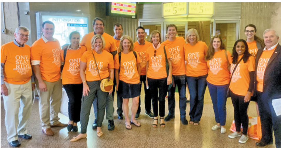
Photo caption: Mayors, elected officials and volunteers at Newark Penn Station on Wednesday, September 18th after the RVL Mayors Alliance rally to help bring attention to the needed improvements along the RVL.